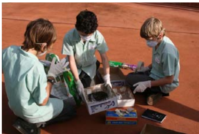
Photo 2: Students investigating scientifically - Which soil is the best growing medium?