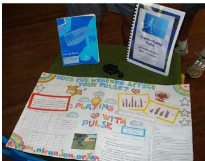
Photo 3: Science Fair presentation - Does the weather affect your pulse?

and the authors welcome discussion of the model and the contribution that it can make to addressing the identified need of providing significant support for primary science education.